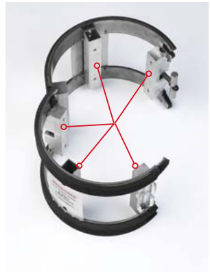
Adaptor Feet Attach Here