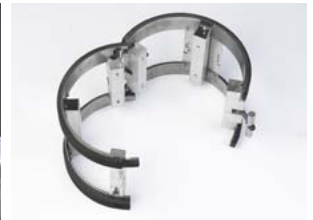
Guide Rings Mount Head on Pipe