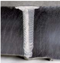
Narrow Gap Bevel Geometry shown on 25 mm [1"] wall pipe